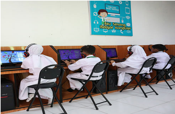
Figure 1. Children's use digital media

Currently, early childhood are faced with digital media, so the right strategy is needed (Na'imah, 2022). At Al-Azhar 54 Islamic Kindergarten Pekanbaru, teachers also use digital media such as videos shown to children. Besides that, the teacher also makes media with picture cards related to Malay culture, such as various foods and drinks, as well as Malay traditional clothes (Nurhayani & Nurhafizah, 2022) describes the media used in developing early childhood literacy, including digital literacy media, ICT (Information and Communication Technology), picture story books, APE (Educative Game Tools), science books, learning videos, interactive media and word card media. Literacy strategies need to be carried out in various ways. one way that can be done is to apply literacy strategies in language learning based on local wisdom (Ediyono & Alfiati, 2019).