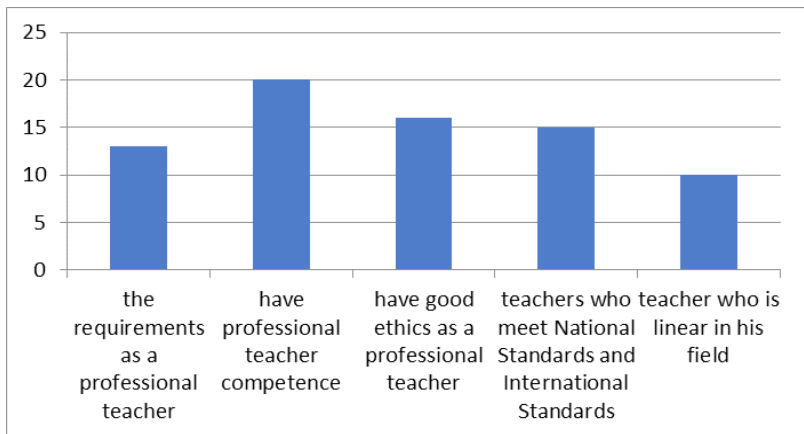
Figure 2. Research Results of Respondents on The Context of Professionalism Among Early Childhood Education Teachers in Indonesia