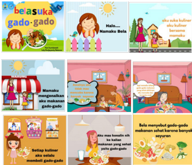
Figure 2. Storybook developed by group 1

Meanwhile, the story book developed by group 1 entitled “Bela likes Gado-gado” is present figure 2 below