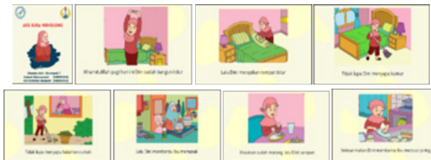
Figure 6. Storybook developed by group 8

The storybook design developed by group 8 is “I Like to Help”. The draft story idea is not explained in detail. The presentation given leads to story books related to everyday life. The storyline is not presented by the author in a coherent manner and does not start with a good start, so the climax of the storyline does not appear. The storybook developed by group 8 entitled “I Like to Help” is presented in Figure 6 below.