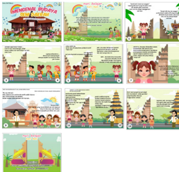
Figure 3. Storybook developed by group 2

The story entitled Getting to Know Local Art Culture originated from an idea that aims to introduce art and culture in Indonesia. In addition, it also aims to teach children to respect and preserve Indonesian culture and accept differences in regional origins because Indonesia is made up of hundreds with so many regional dances. Storybooks are also made in two languages, namely Indonesian and Javanese. The bilingual storybook aims to invite children to become more familiar with the Javanese language so that children are more familiar with and able to communicate with the Javanese language so that the Javanese language does not quickly become extinct because it is not known and even used anymore. Meanwhile, the story book developed by group 2 entitled “Getting to Know the Local Art Culture” is presented in Figure 3 below.