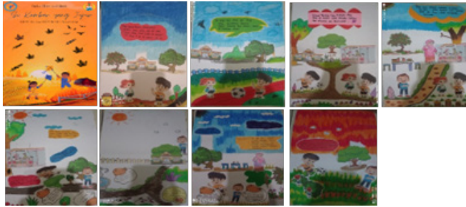
Figure 7 Storybook developed by group 9

From Figure 15 above, the storyline is presented coherently by the author but capturing positive experiences has not provided positive experiences for early childhood. In addition, in terms of language, it is very easy and simple for young children to understand. The author is still confused about making storybooks for early childhood, this can be seen from the use of communication balloons that should not appear in early childhood storybooks. These pictures are presented in an attractive appearance and color for young children to read. The number of pages is in accordance with the guidelines for writing story books set by researchers so that it makes it easier for young children to understand the meaning of the stories written by the author.