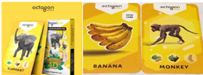
Figure 1. Animal 4D augmented reality flashcards from www.octagonedu.com

Another advantage of the AR flashcards issued by www.octagonedu.com is that each card is also equipped with information related to the animal category based on the type of food consumed, such as the animal belonging to the herbivore, carnivore or omnivore group. In addition, this card is also equipped with information about the environment in which animals live, namely savanna, forest, livestock, tundra, poles, or oceans. This information also provides children with new knowledge regarding the characteristics of each animal in addition to the prior knowledge related to the English pronunciation of animal names accompanied by the sound or how to move the animal. The following is an example of AR flashcards used in this research.