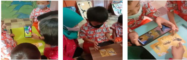
Figure 4. Children use AR flashcards to learn English vocabulary

Based on the information from the teacher interview, using AR flashcards can help them teach English vocabulary to their students when they have to introduce English animals with their characteristics. It is indeed a solution for the teacher at Marsudisiwi Kindergarten, who is constrained when teaching English to her students. By applying this medium, she feels more confident in teaching English vocabulary, especially animal names, to their students.