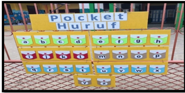
Figure 6. Alphabet Pocket Media

State Kindergarten impacted teachers and children in the classroom. Researchers gathered information from research findings about the impact of pocket-sized media on classroom learning.