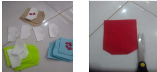
Figure 2. Flannel Fabric Consisting of Brown, Red, Green, and Blue that has been Cut Out