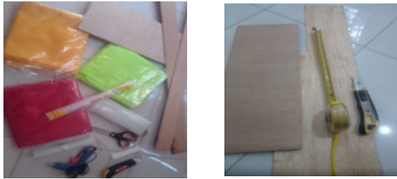
Figure 1. Tools and Materials

Figure 1. The tools and materials that researchers have prepared: are plywood, flannel, scissors, a knife, a small firing knife, glue, a ruler, nails, a hook, a hammer, and a ruler.