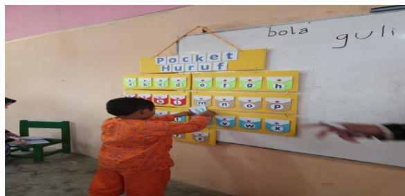
Figure 7. The Process of Learning Activities with Alphabet Pocket Media

The alphabet pocket media implemented in the Pembina Peureulak State Kindergarten positively impacts children's language and motor skills. Children actively participate in the learning taught by the teacher. Children are also active in asking questions that the teacher does not understand. Children also repeat and pronounce the letters and words spoken by the teacher during the learning process using pocket letter media.