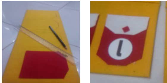
Figure 4. A Red Flannel that has been Glued with a Yellow Colour, then on a Red Flannel, Glued with the Letters of the Alphabet.