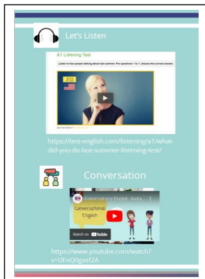
Figure 1. Materials Display in E-module

prefer to prepare and execute. The e-modules produced are suitable for application in educational settings, and it has been demonstrated that their utilization is effective in increasing students' degrees of autonomy and improving the ability to utilize digital material.