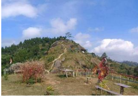
Picture 1. Bukit Tumpak Siman