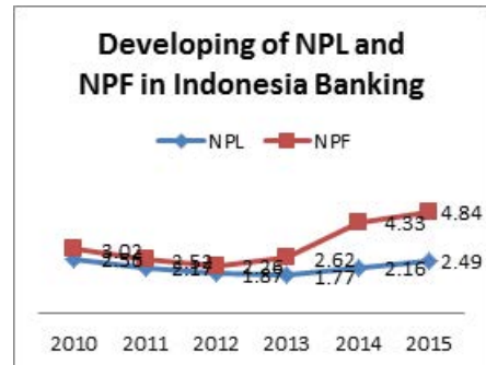
Figure 1: Developing of NPL and NPF in Indonesia Banking

To know the condition of NPL and NPF in Indonesia Banking can be seen in the following graph: