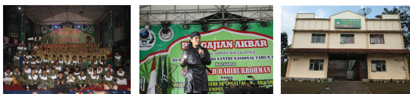
Figure 3 Some Pictures of the Activities and Conditions of Ma'had Al-Jami'ah IAIN Salatiga

The agreement of 50 leaders of Perguruan Tinggi Keagamaan Islam Negeri (PTKIN, State Islamic Higher Education) throughout Indonesia, should have been formulated and mandated by all PTKIN in Indonesia, including IAIN Salatiga. One environment worthy of being an antiradicalism agent at IAIN Salatiga is Ma'had Al-Jami'ah given its existence within the campus environment for twenty-four hours. Not to mention the mahasantri figures who live in it which are generally used as a model by other students, because of their religious scholarship that exceeds students outside Ma'had, no exception to Ma'had Al-Jami'ah IAIN Salatiga. Following are some pictures of the activities and conditions of Ma'had Al-Jami'ah IAIN Salatiga.